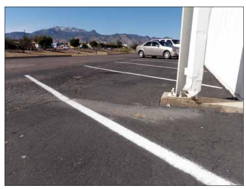
Downspout to Nowhere: This downspout is typical of lost opportunities to reap the benefits of stormwater, as it pours out into a parking lot and drains into a neighboring wash—without feeding into shade-providing, habitat-supporting desert landscapes along the way.

(Where does your downspout flow continued next page)