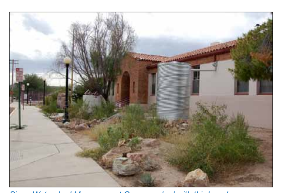
Since Watershed Management Group worked with third graders on projects at this Tucson elementary school in 2009, a cistern and earthworks make the most of roof runoff to water landscape plants and keep stormwater from flooding off school grounds into a neighborhood street. Now, neighborhood leaders are bringing residents together to implement the same concepts along nearby streets.

As cities discover that they can save money on stormwater infrastructure and pollution clean-up by encouraging these methods, dozens of them have started to distribute rain barrels or install rain gardens for residents and businesses.