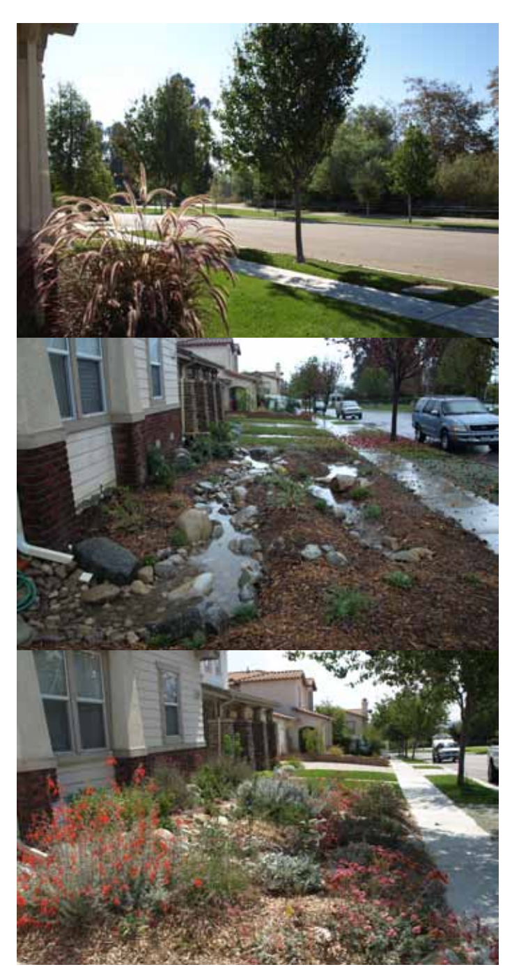
Stormwater-capture Transformation: A downspout at the corner of this Ventura, Calif. residence once flooded water downslope to the street. After a Ocean Friendly Gardens workshop, earthworks captured water in the yard—supporting a lush garden the following year.