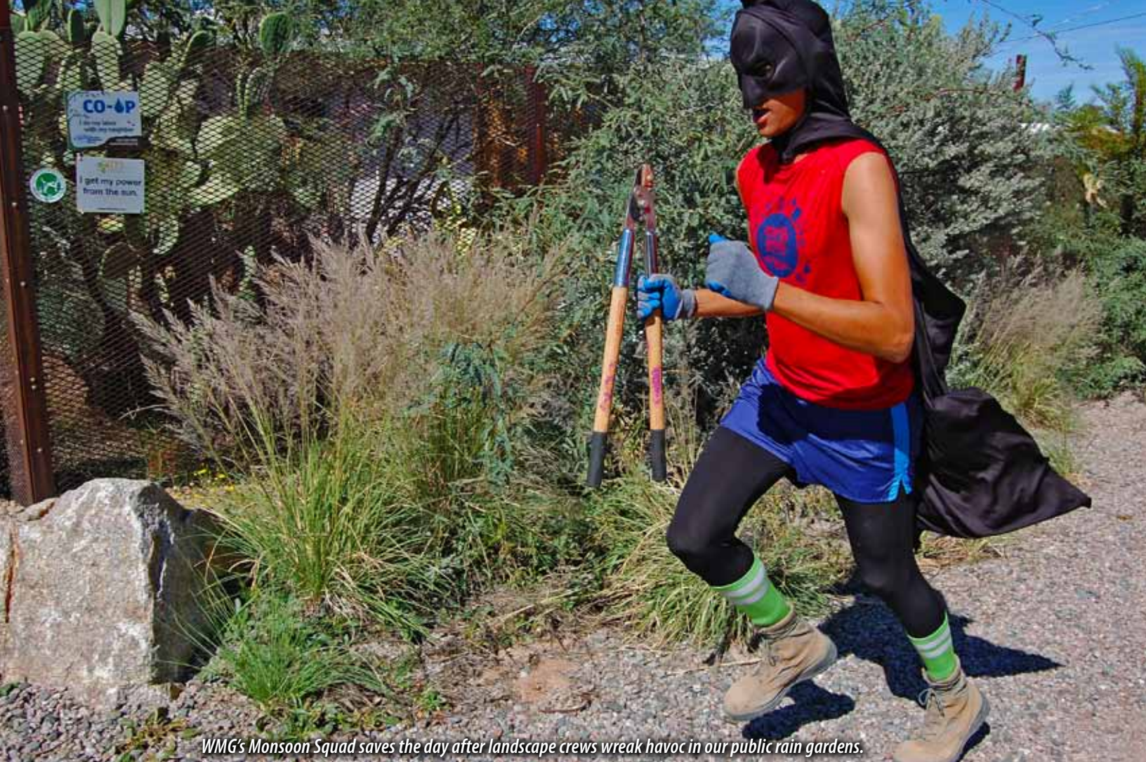
WMG's Monsoon Squad saves the day after landscape crews wreak havoc in our public rain gardens.