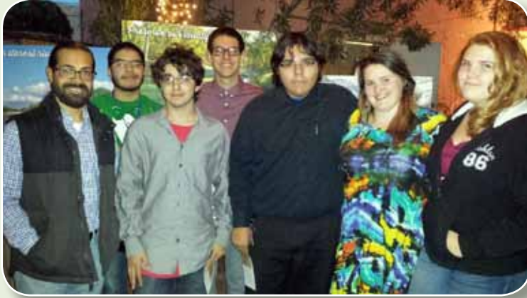
Youth River Stewards attend a Community Water Coalition event and network with local professionals.

If youth truly are our future, then the leaders of tomorrow are going to come out of the Western Institute of Leadership Development. Known by the fun—and apt—acronym of WILD, this Tucson charter high school involves their students deeply in experiential learning. WMG had the opportunity to partner with WILD on two transformative projects in 2014.