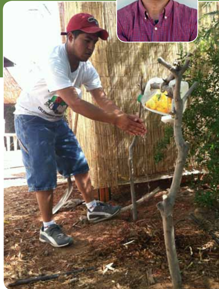
A student from Mexico experiences the tippy tap hand washing station at the Living Lab.