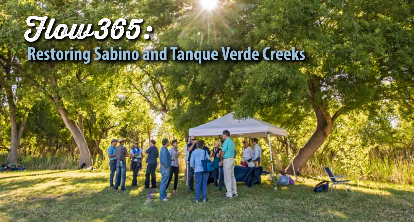
WMG donors gather for rainwater cocktails at WMG's Tanque Verde Flow and Feast event, at a private property right along Tanque Verde Creek.