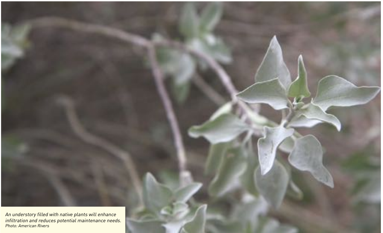
An understory filled with native plants will enhance infiltration and reduce potential maintenance needs.

The health and performance of GI is based on the health of the underlying soil. A Tucson, AZ based study of GI showed that within a few short years the native soil ecosystem attained the diversity of a mature forest soil if certain conditions were maintained. 51 These GI systems all utilized native soil without soil conditioning amendments and included native plant understory and trees, organic surface mulch (tree trimmings), and received street stormwater were much more diverse than surrounding soils that did not receive stormwater inputs or GI systems that utilized rock mulch instead of organic mulch.