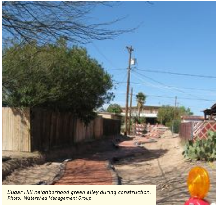
Sugar Hill neighborhood green alley during construction.

First-flush retention. Defined in the Pima County RFCD’s Design Standards for Stormwater Detention and Retention as the capturing and retaining of the stormwater runoff volume from 0.5 inch of rainfall on all newly disturbed or impervious areas for new development or redevelopment. Often, requirements can be readily achieved through GI practices.