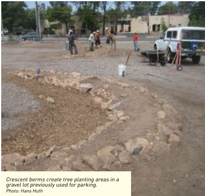
Crescent berms create tree planting areas in a gravel lot previously used for parking.

Crescent berms. Sometimes called “tree eyebrows” by Trees for Tucson, these round or boomerang shaped mounds of rock and soil are created perpendicular to runoff flow and may have a shallow excavation to hold water uphill of the berm. The berm is often placed outside the drip line of the tree and helps to detain the water and increase soil moisture.