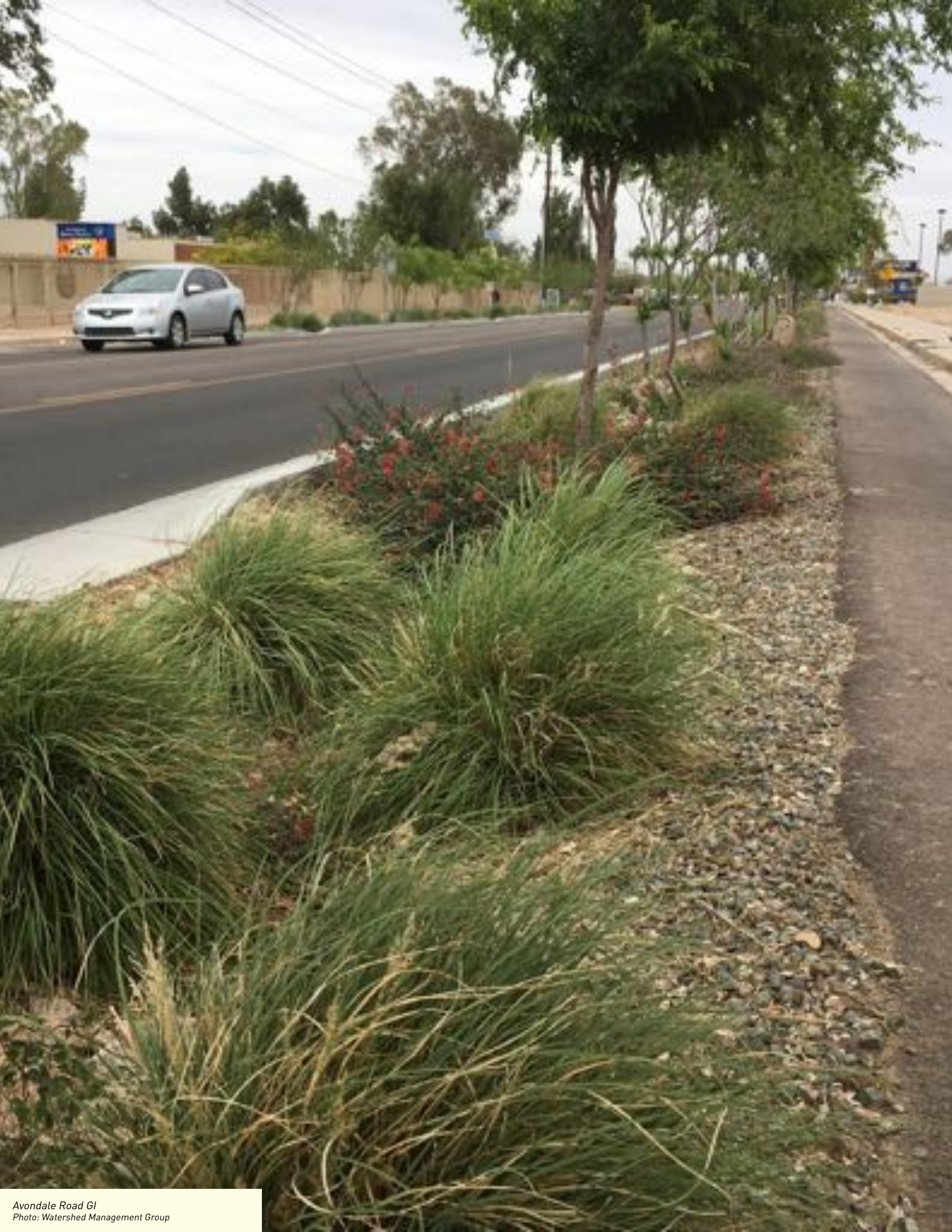
Avondale Road GI