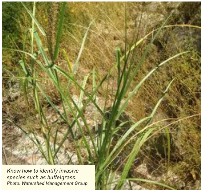
Know how to identify invasive species such as buffelgrass.

Irrigation ideally is used for only the three year plant establishment period as it is prone to leaks and failure to seasonally change irrigation schedules. Leaks and lack of schedule adjustments lead to over-watering of the plant material. This often results in saturated soil or even ponding conditions and/or larger growth than expected of the plants which increases pruning maintenance costs.