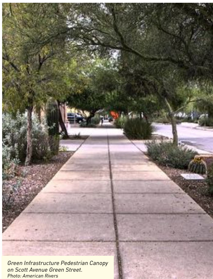
Green Infrastructure Pedestrian Canopy on Scott Avenue Green Street.

to successful implementation of GI since streets are where stormwater flows. Issues and corresponding solutions in this resource guide were identified by local experts in GI and transportation engineering and planning. Top local concerns that were addressed in this document include utilities, flooding, sediment, and maintenance. This playbook is a product of American Rivers based on a general national guide filled in with local details by jurisdictions within Pima County where examples were available or with other Western examples to address any remaining gaps and models. This guide is intended to be a resource for transportation-oriented staff and to provide examples and illustrations of planning, funding, and project design approaches that may be relevant to the Pima County area. It is in no way intended to be interpreted as administering official policy, preferences, or design specifications.