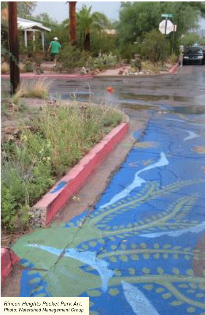
Rincon Heights Pocket Park Art.

FEMA's Flood Hazard Mitigation Assistance program provides funding support to communities for projects that reduce the risks associated with flood and drought conditions. Aquifer storage and recovery, floodplain and stream restoration, flood diversion and storage, and GI methods are eligible for funding. 42