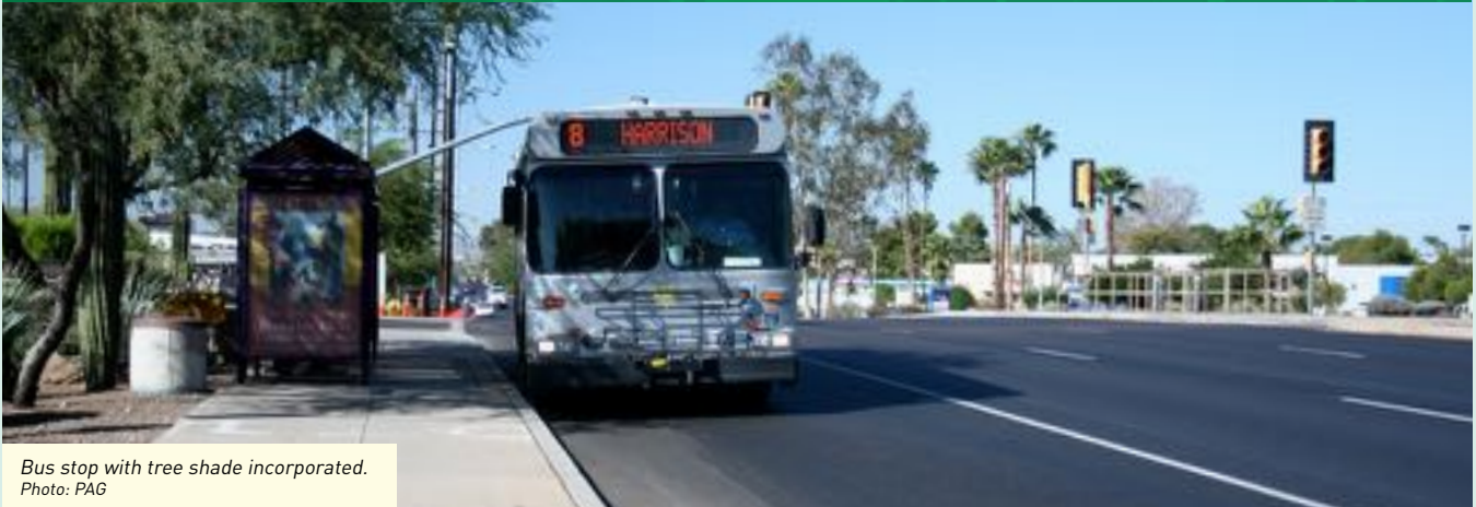
Bus stop with tree shade incorporated.