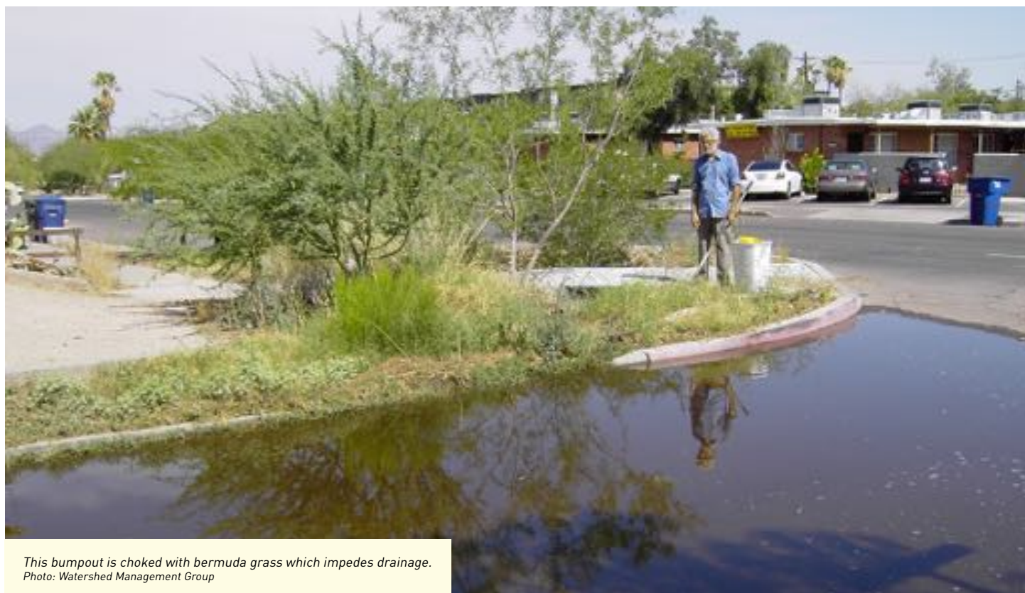
This bumpout is choked with bermuda grass which impedes drainage.

Often asphalt surfaces are imperfect and can be problematic in GI retrofit projects when flush header curbs are installed. It is important that consideration of even small runoff contributions which provide the irrigation value to the associated plants be allowed to freely flow across the header curb into the bioretention area. This may require addressing either the surrounding asphalt surface and/or slightly lowering the header curb to ensure even the smallest runoff events are not diverted around the GI feature and not provide an irrigation benefit or create nuisance ponding in the roadway.