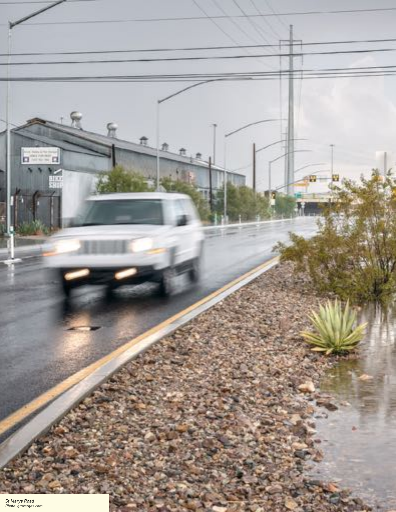
St Marys Road