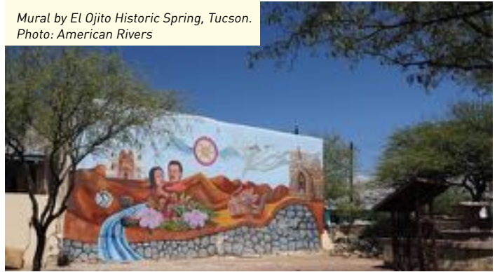
Mural by El Ojito Historic Spring, Tucson.

Tucson-area cities and towns or Pima County may consider a bond issuance that is specifically intended to fund GI projects, either as a “stand alone” effort or perhaps as part of a broader investment package intended to fund climate resiliency projects. 33