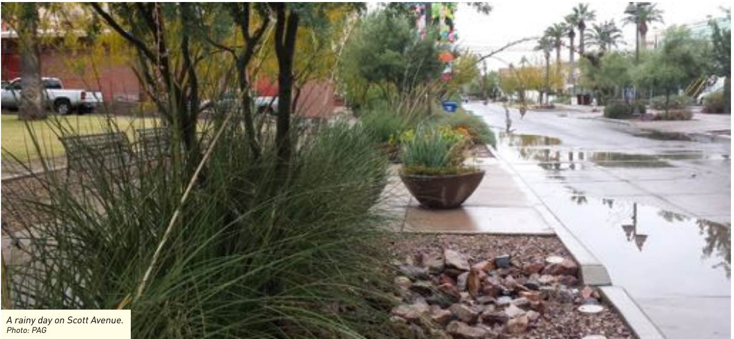
A rainy day on Scott Avenue.