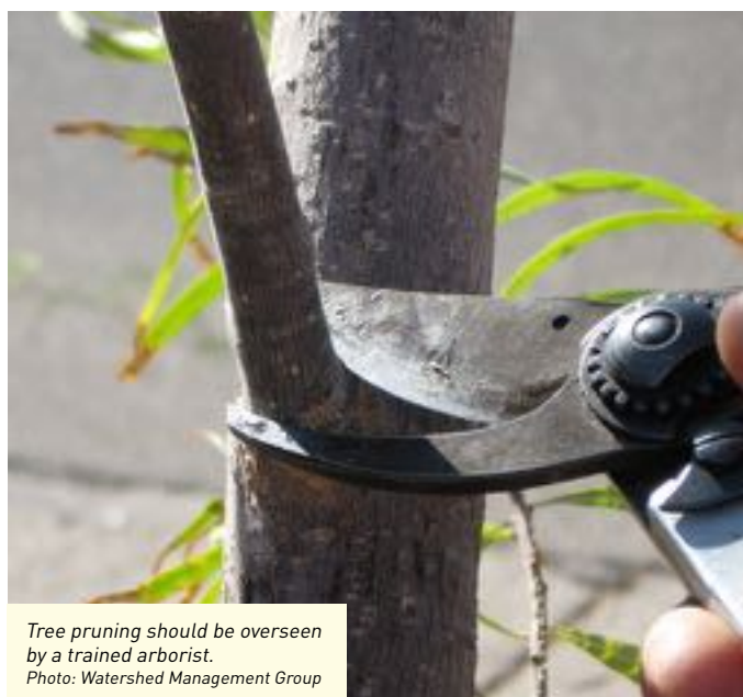
Tree pruning should be overseen by a trained arborist.

These chemicals should only be used in a sparingly spot application to deal with the most aggressive invasive species (e.g. buffelgrass). Mechanical removal is the preferred method and if done following rainfall events can be efficiently and easily