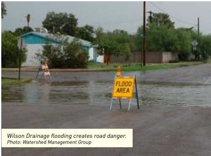
Wilson Drainage flooding creates road danger.

the street. On multi lane roadways, at least one travel lane in each direction shall be free from flooding during a 10-year flood. Otherwise storm drains, drainage channels, or other acceptable infrastructure shall be provided to comply with all-weather access requirements. In order to meet the above design criteria, Tucson employs a mix of traditional drainage practices and water harvesting/ GI methods. 46