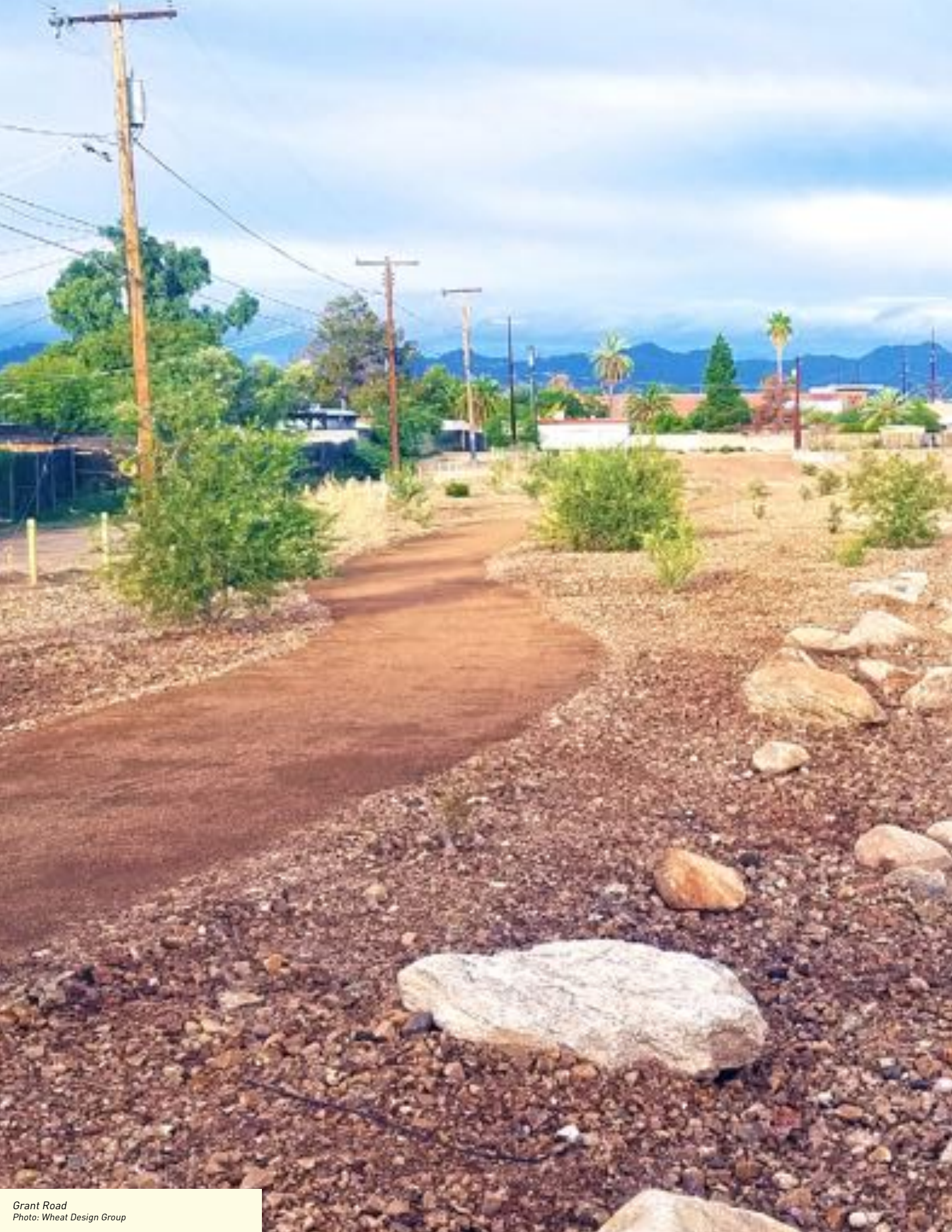
Grant Road