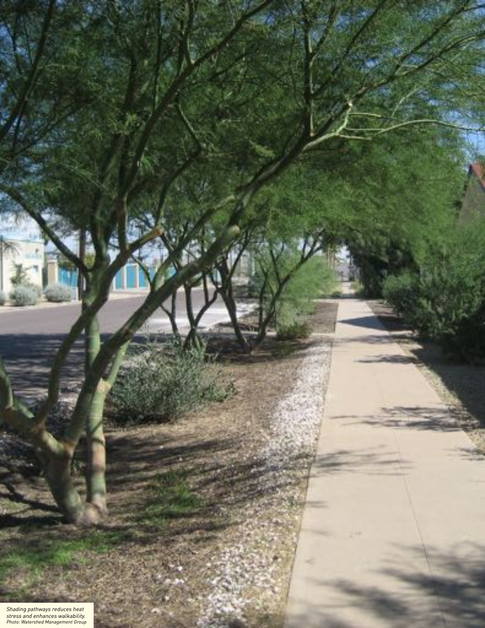
Shading pathways reduces heat stress and enhances walkability.