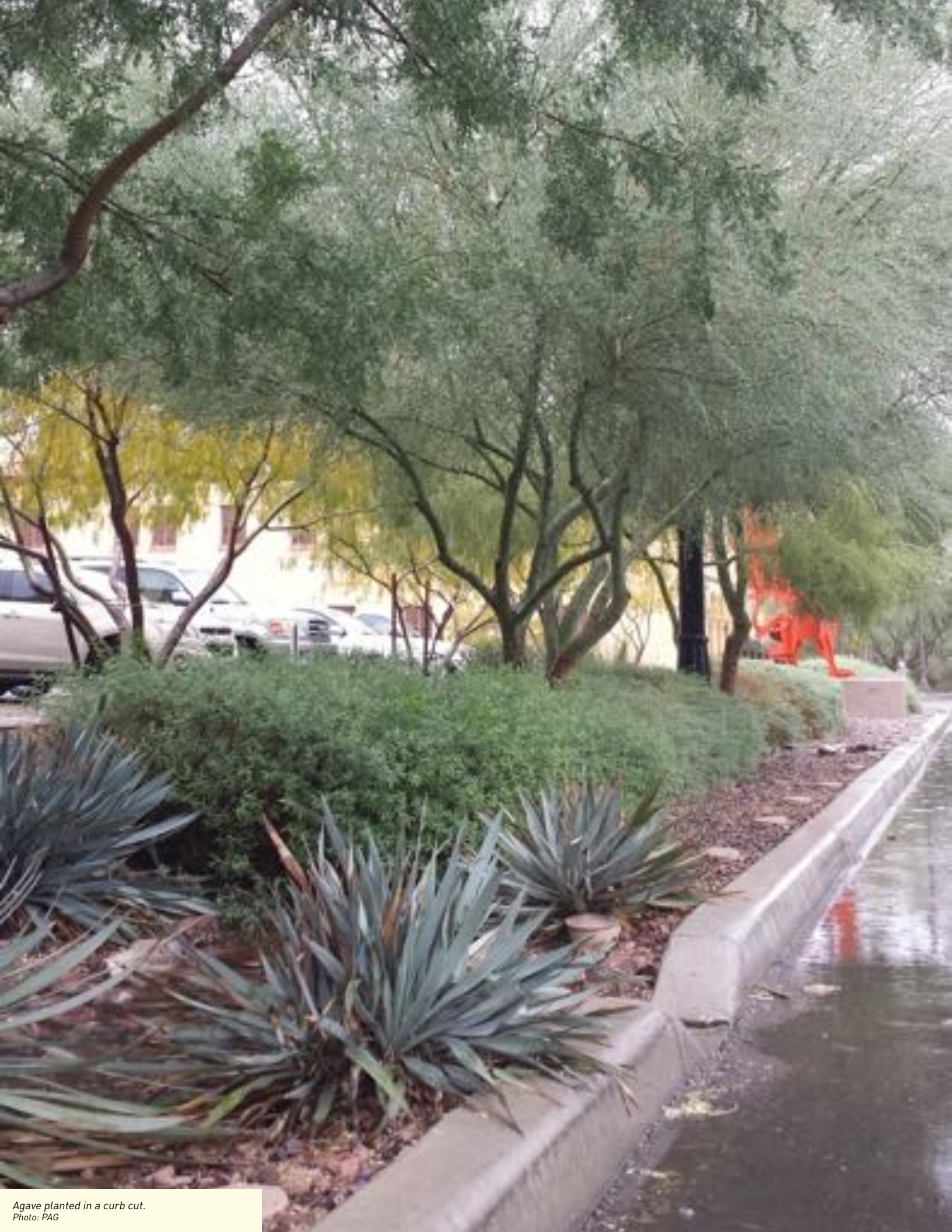
Agave planted in a curb cut.