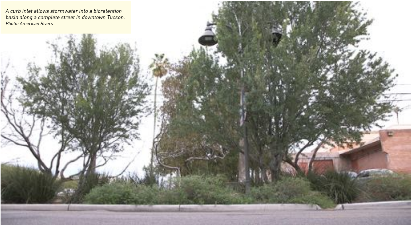
A curb inlet allows stormwater into a bioretention basin along a complete street in downtown Tucson.

Smaller native, low water use, understory plants that grow 3ft or less to maintain site visibility and provide bioremediation function and facilitate infiltration and percolation: