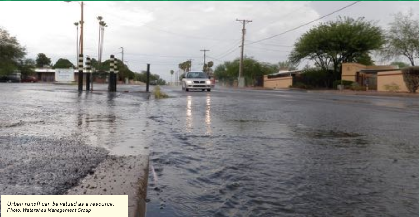
Urban runoff can be valued as a resource.

A 2017 drainage memorandum 47 by Kimley-Horn Associates (planning and design engineering consultants) regarding a drainage analysis for the Glenn Street Neighborhood Improvement Project from Columbus Blvd to Country Club Road reviewed the potential flood risk of