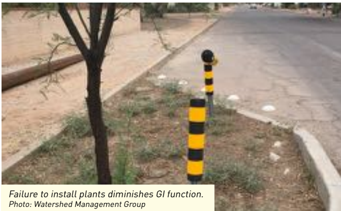
Failure to install plants diminishes GI function.

Sediment may act as a beneficial mulch unless accumulation of fines in the basin affects retention, infiltration of stormwater quality goals. Sediment traps can be used in those cases if maintenance regimes support periodic clean out. Sediment maintenance is covered in detail in the Soil Stability Design and Design checklists. Be careful not to plant near the inlet which may inhibit stormwater flows into the basin.