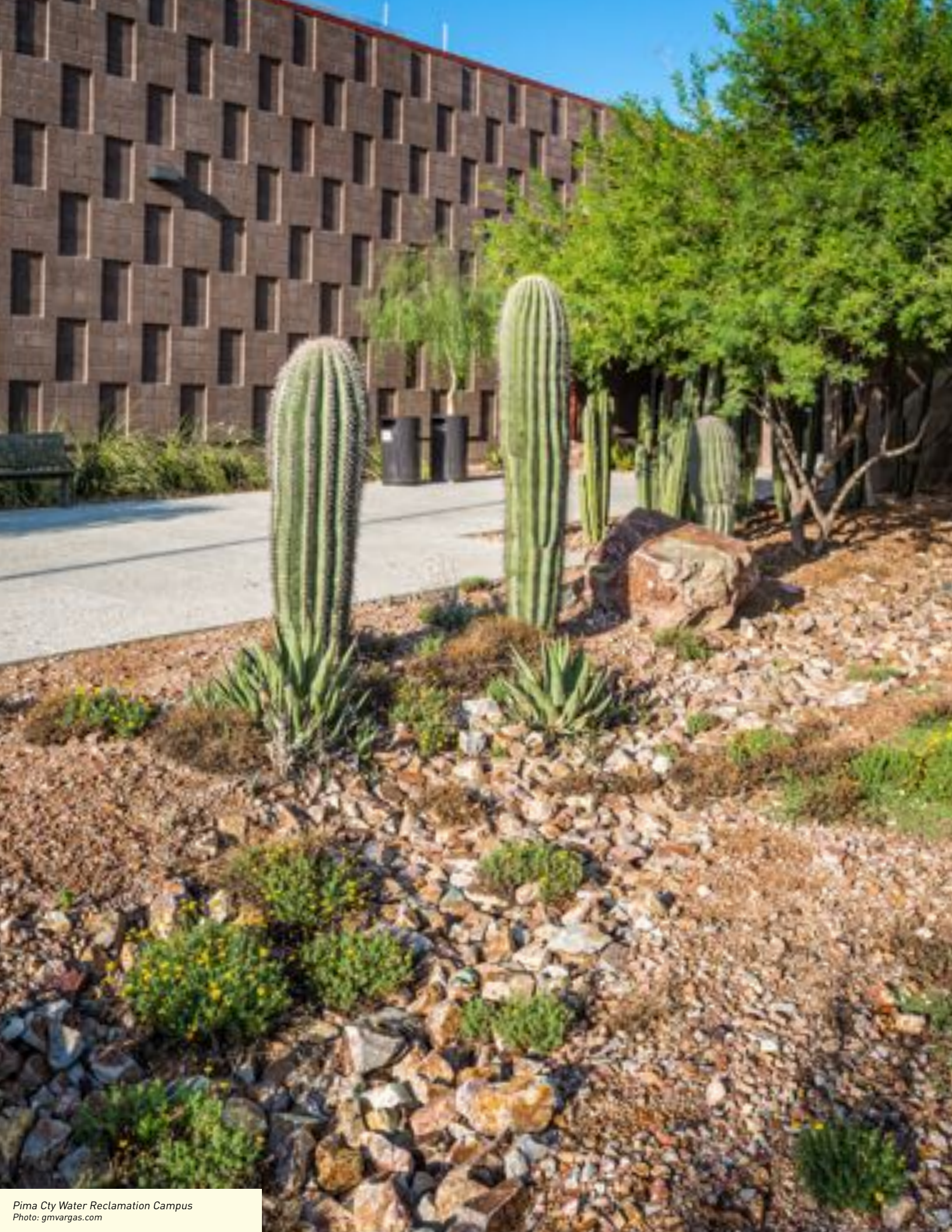
Pima City Water Reclamation Campus