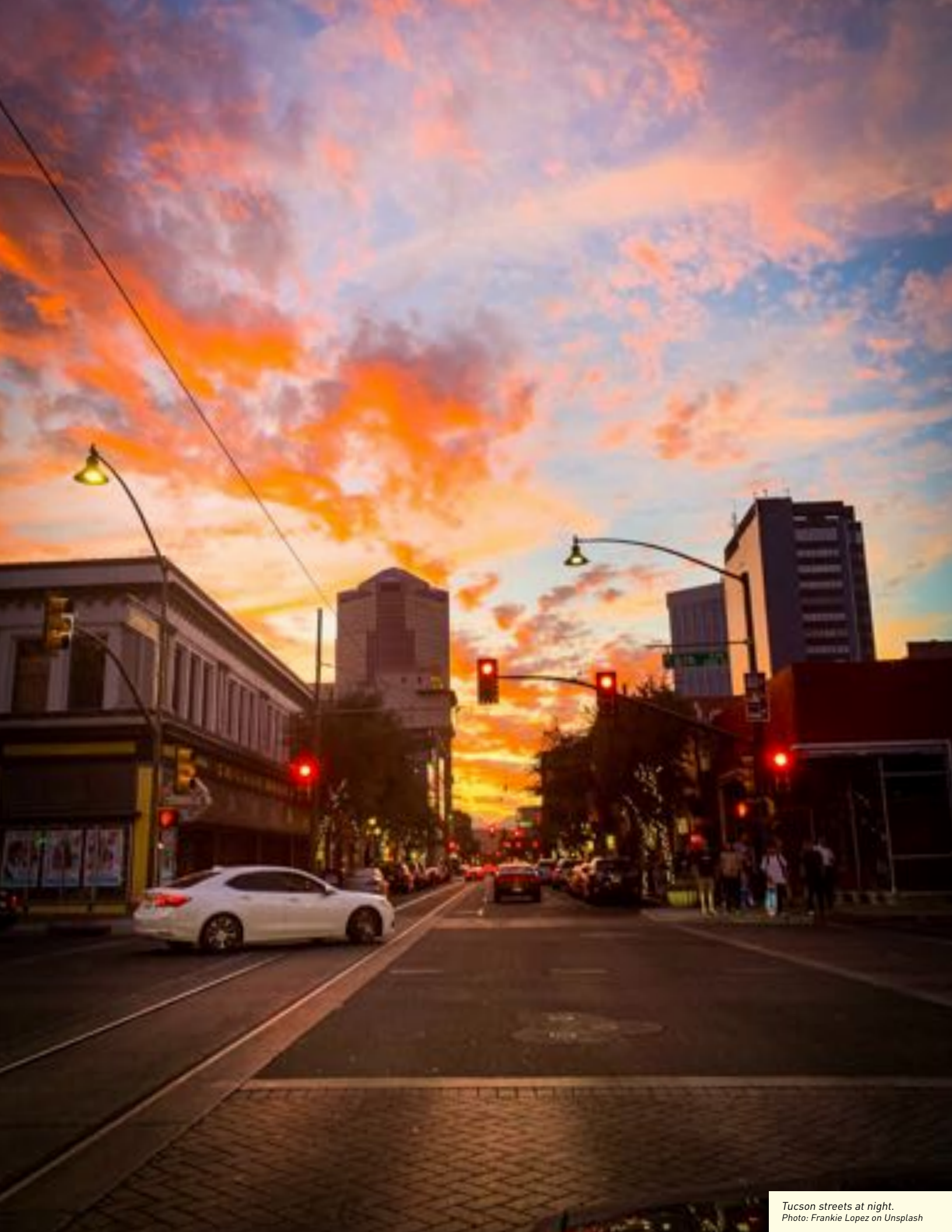
Tucson streets at night.