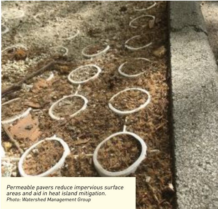
Permeable pavers reduce impervious surface areas and aid in heat island mitigation.

integrated management practices) and individual small-scale stormwater management practices (isolated LID practices) that promote the use of natural systems for infiltration, evapotranspiration and the harvesting and use of rainwater. Sometimes the term is used interchangeably with GI.