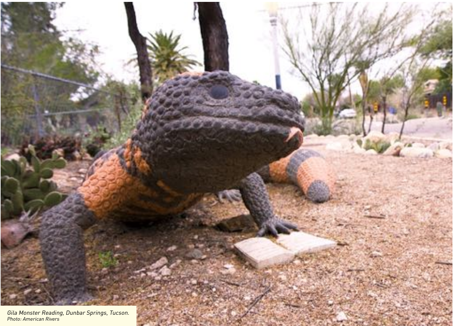
Gila Monster Reading, Dunbar Springs, Tucson.

While public agencies, including transportation departments, have a necessary role in advancing GI, their reach generally is limited to projects on public property. There are considerably more GI opportunities on private properties, and realizing these opportunities requires the participation of property owners, managers, real estate developers and contractors. In order to meet community GI goals, agency project review and planning staff must encourage developers to design and install GI practices as part of their compliance with local codes, ordinances, and community plans. A local successful example is the City of Tucson Commercial Harvesting Ordinance review process.