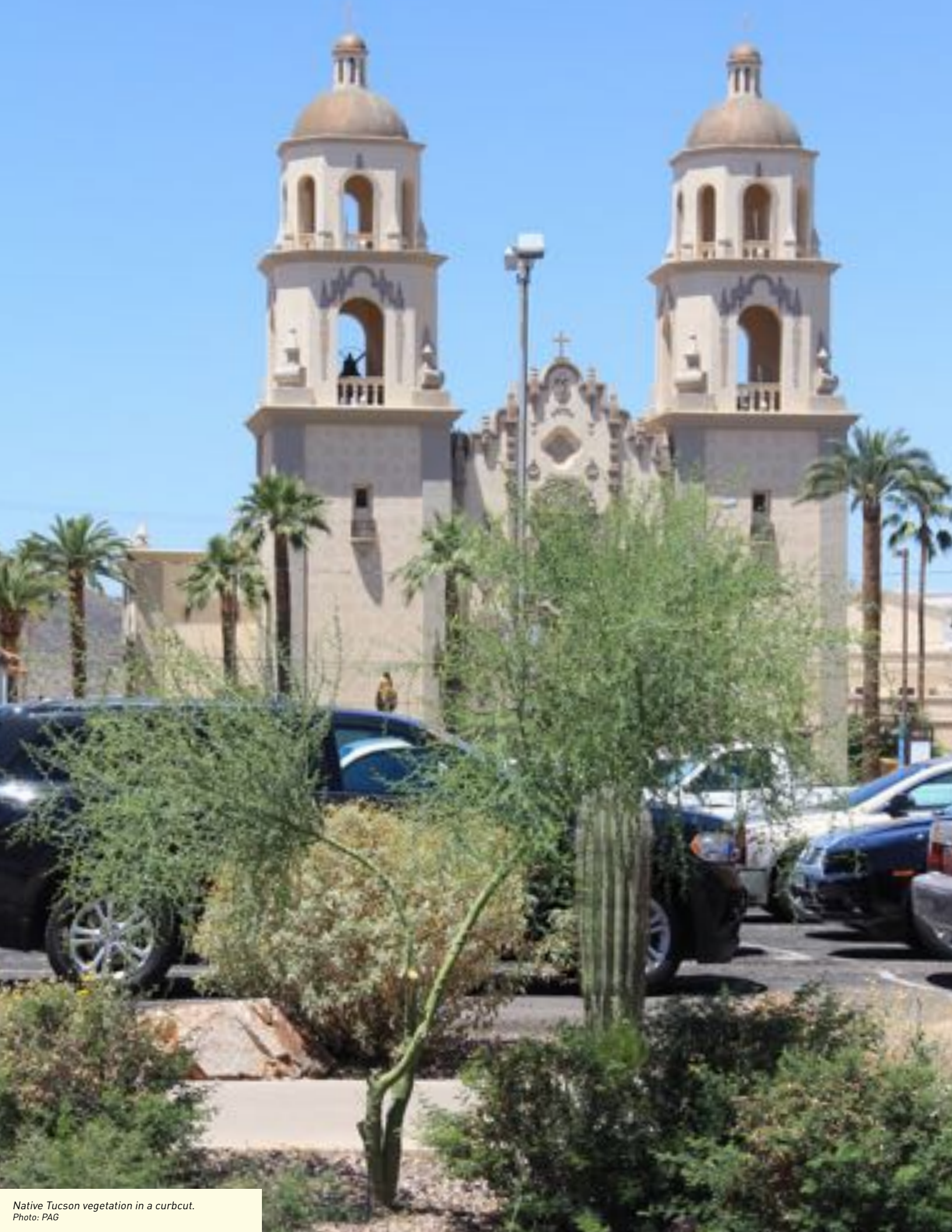
Native Tucson vegetation in a curbcut.