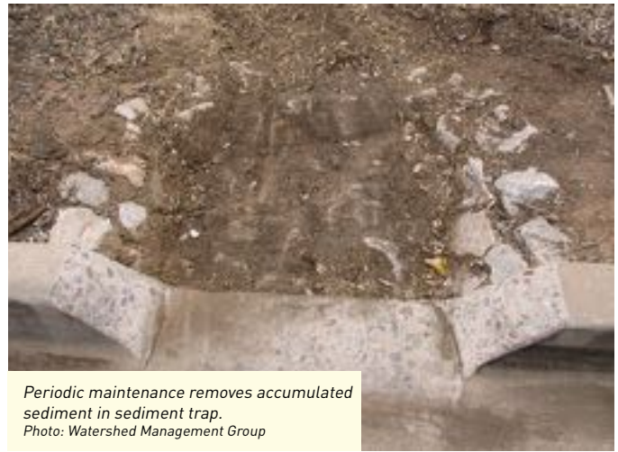
Periodic maintenance removes accumulated sediment in sediment trap.

Weed whacking of naturalized understory and/or native bunch grasses along roadway edges may be desirable for seasonal maintenance. Protection of tree species may need to be considered either with spacing or with adding root collar guards to the trees. Weed whacking is an effective treatment method for areas overtaken by Bermuda grass. The planning of planting trees or shrubs should be done carefully to minimize damage to these plants knowing that weed whacking will likely occur.