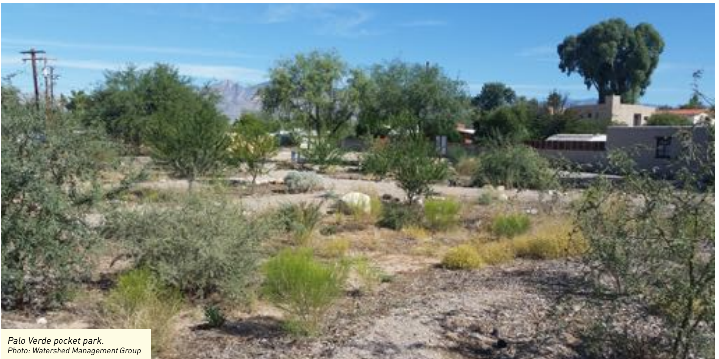
Palo Verde pocket park.

The Urban and Community Forestry Challenge Cost-Share Grant Program is run through the National Urban and Community Forestry Advisory Council (NUCFAC) established in the 1990 Farm Bill under the U.S. Forest Service. 35 NUCFAC assists the Secretary of the U.S. Department of Agriculture in the grant application and development process. The purpose of the grant program is to fund urban and community forestry projects that have a national or regional impact. 36 While this program is not designed to fully fund capital projects or demonstration projects, it could be an important source of funding for capacity building and planning to set policies that incentivize GI for transportation. For example, the Fiscal Year 2020 funding cycle invites applications for projects that integrate urban and community forestry into all scales of planning (including transportation) or for efforts to promote health and resilience of urban and community forests. Previous funding rounds have focused on projects that will address significant barriers to GI, focusing on the role of trees and urban forests.